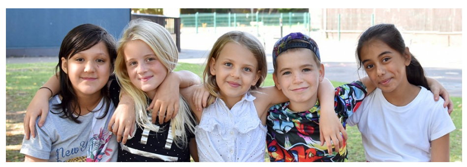
Larkrise Primary School

There is no specified school uniform but there is a dress code. Children should be comfortable, neat and tidy in appearance.