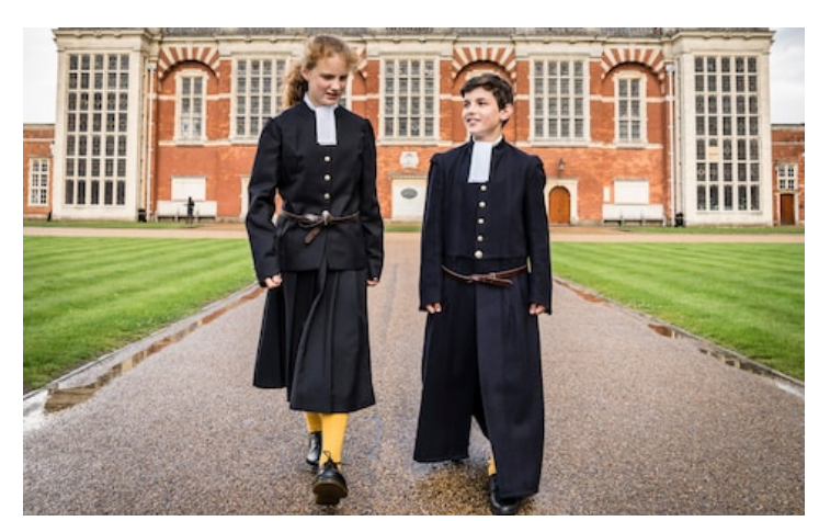
Christ's Hospital School

There is no specified school uniform but there is a dress code. Children should be comfortable, neat and tidy in appearance.